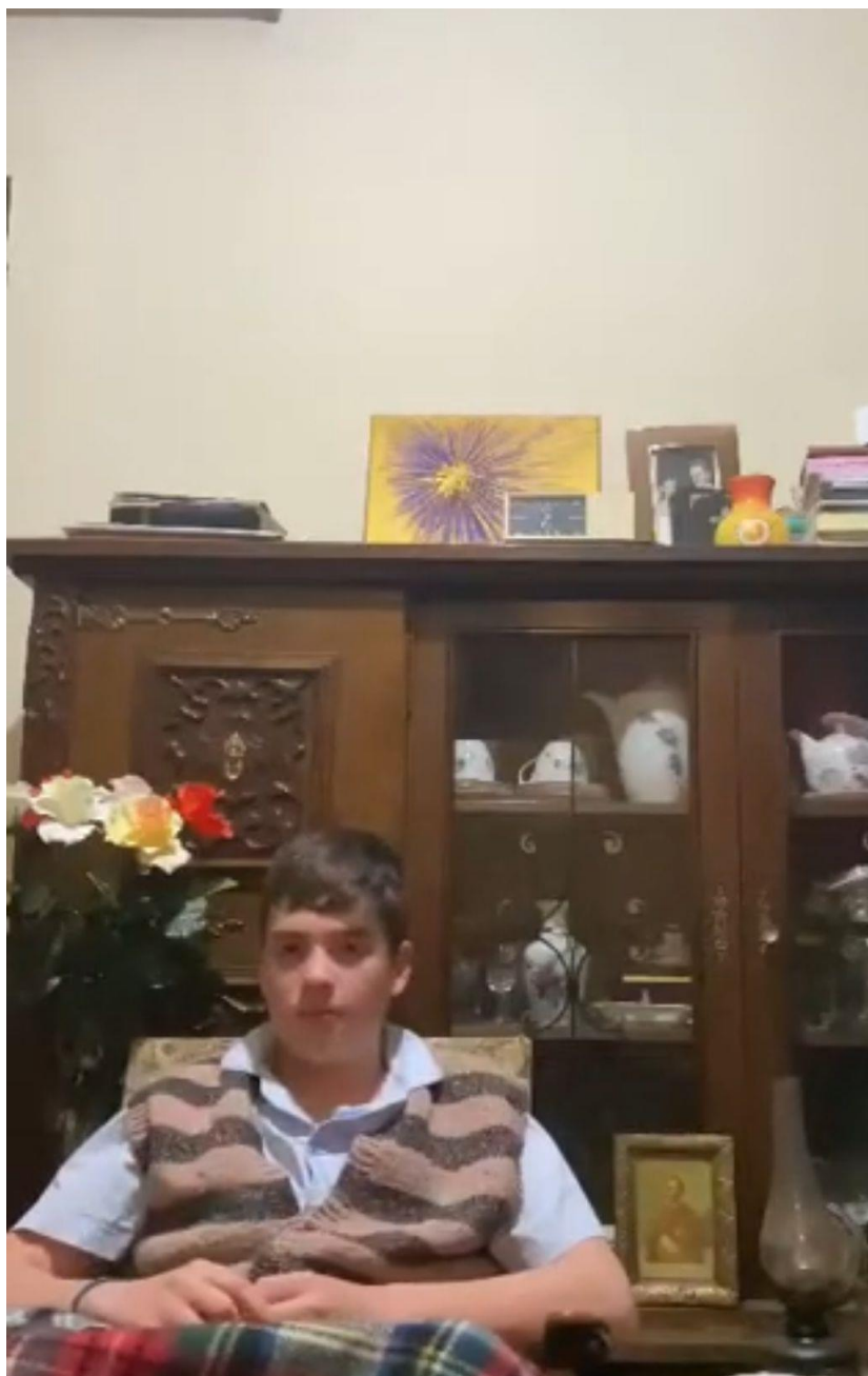
Festival-Concurs Municipal de Teatru in Limba Engleza 2022

History is meant to be repeated if not learnt properly!!