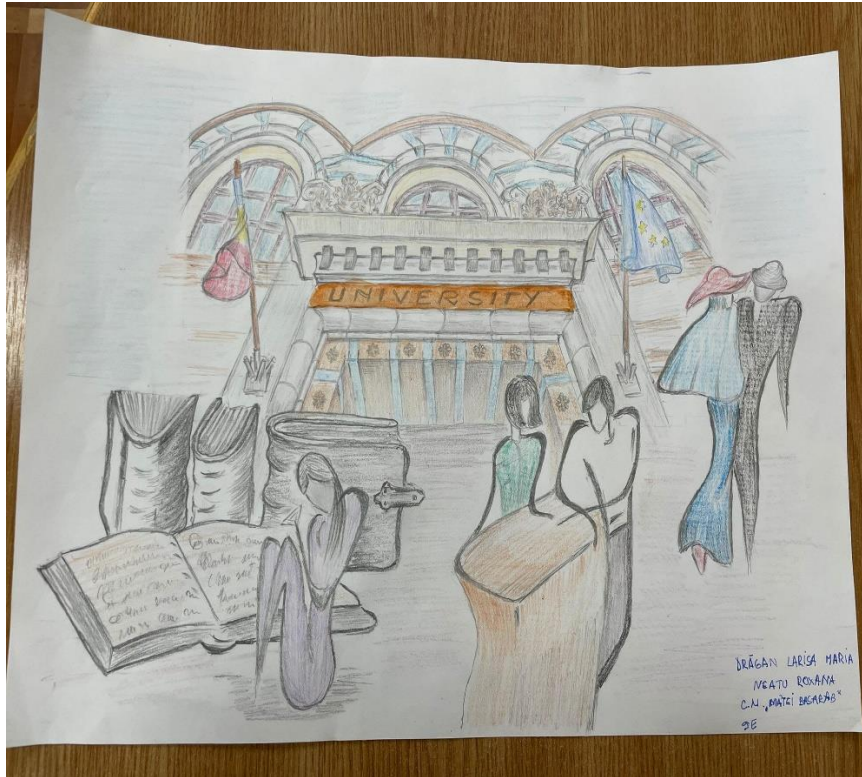
-The books-wings of my soul