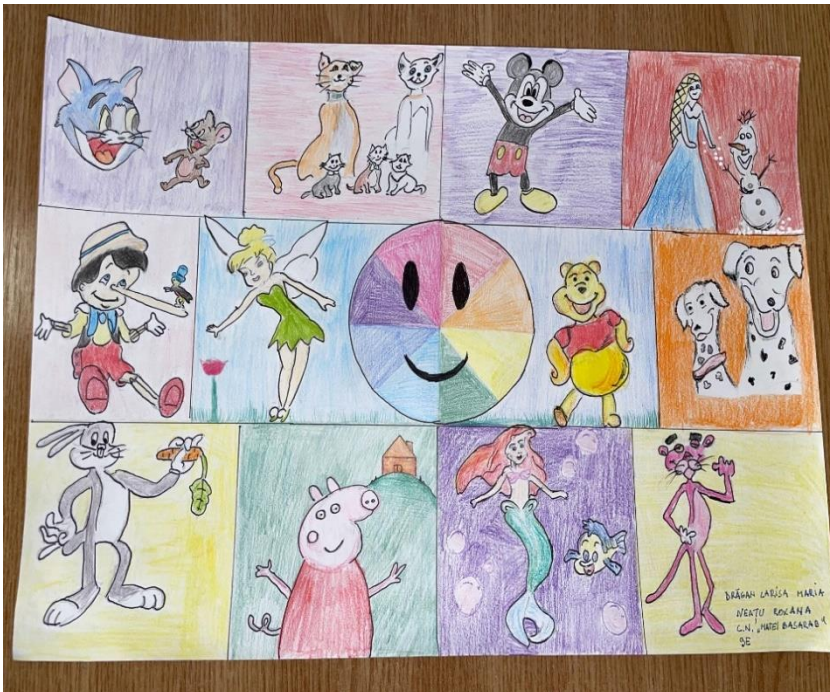
-The colors of a child's smile

What about the mouth?! One line, as far as we can tell. And then her face was complete And my pony could rest asleep.