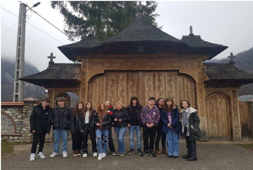
The international camp in Cambridge

"In every walk with nature, one receives far more than he seeks." — John Muir