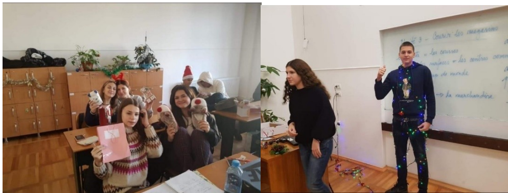
A two-day trip to Horezu

"The greatest gift you can give someone is your time because when you give your time, you are giving a portion of your life that you will never get back."