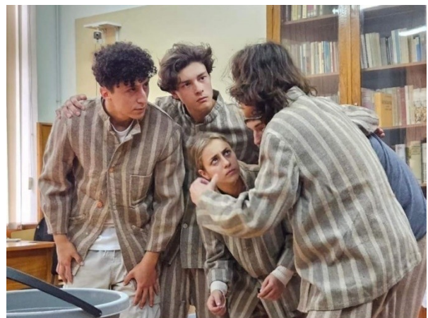
-12B Graders short play